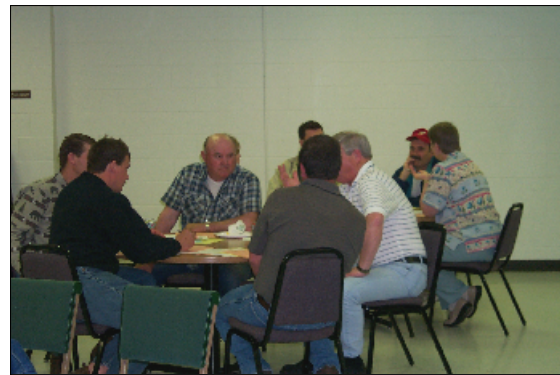
A group of residents works to define the town's strengths and weaknesses.

Everyone was provided a ½ sheet of paper to write down his or her answers. OMNNI asked for volunteers to share their answers. Generally, the answers reflected a great pride in the rural atmosphere of the community. A list of common answers will be provided in the Plan Introduction Chapter of the Town of Winchester Smart Growth Plan.